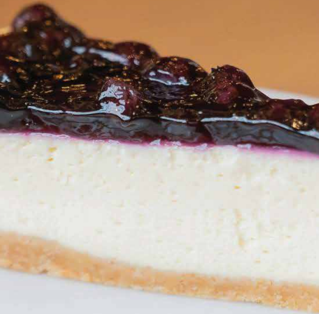
BLUEBERRY CHEESE CAKE