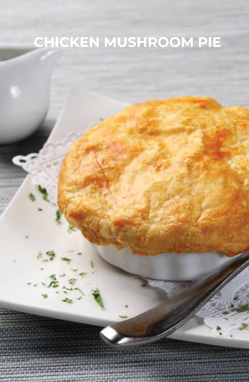
CHICKEN MUSHROOM PIE