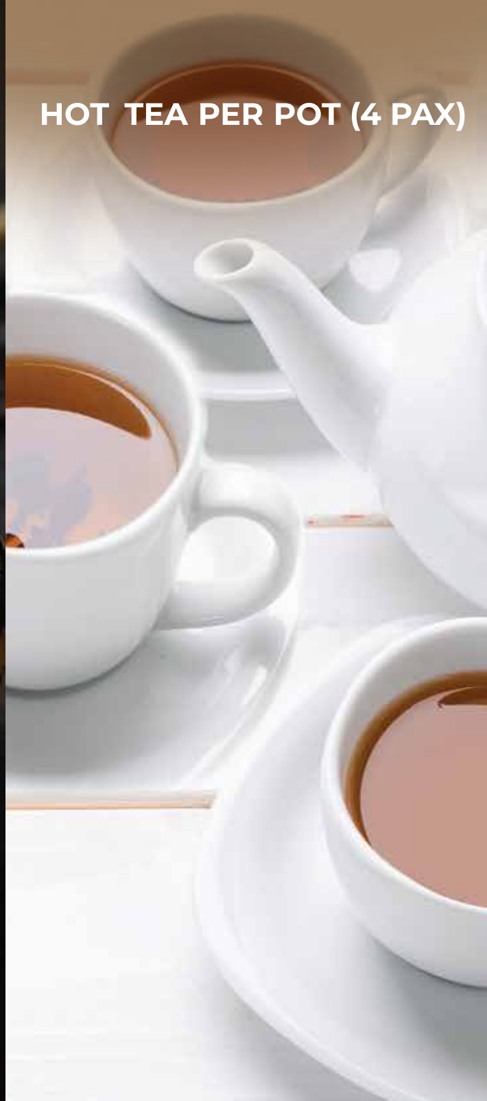
HOT TEA PER POT (4 PAX)