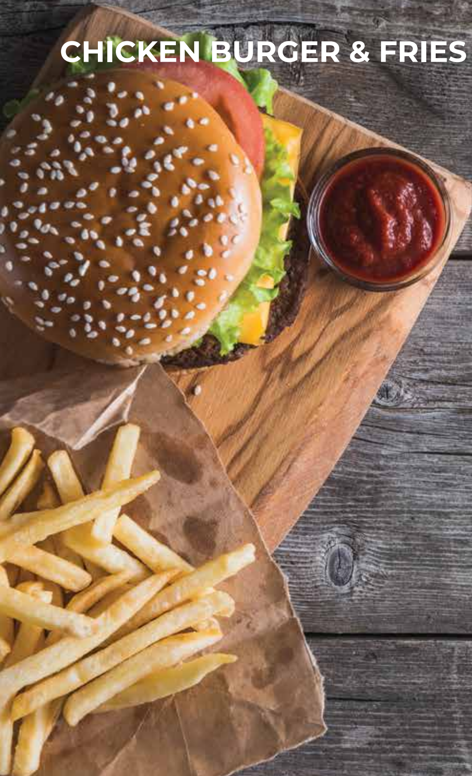
CHICKEN BURGER & FRIES