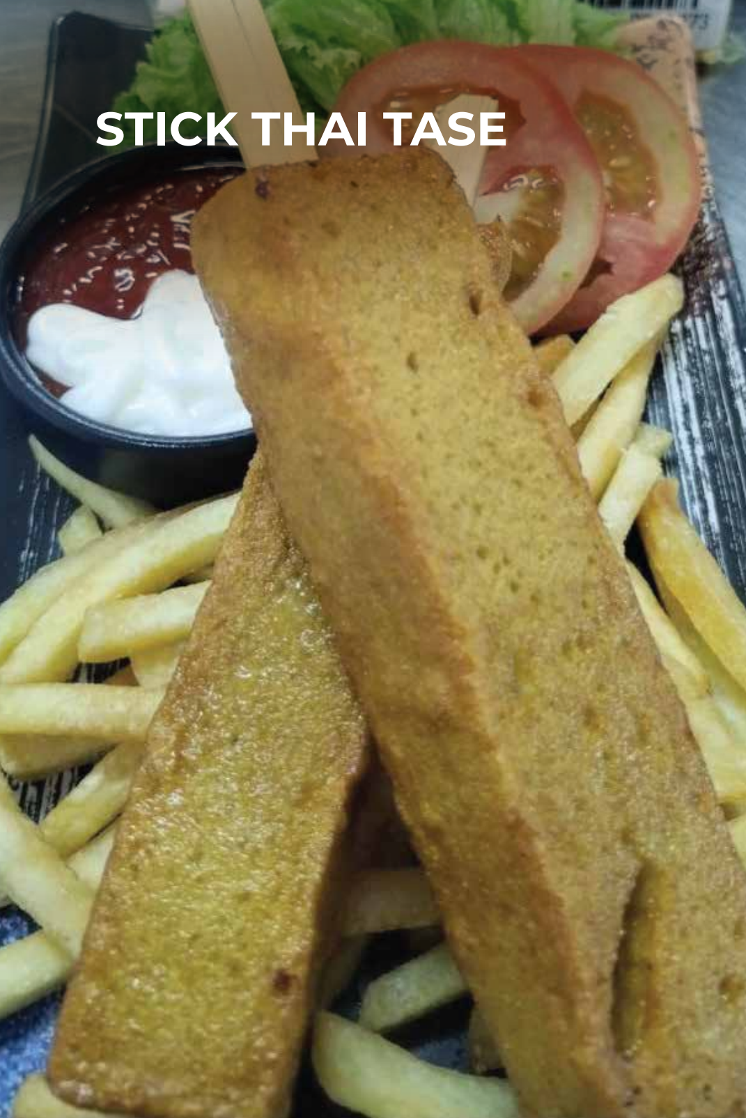
STICK THAI TASE