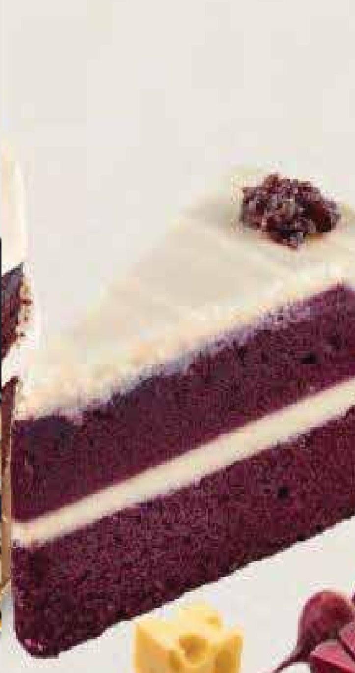
RED VELVET CAKE