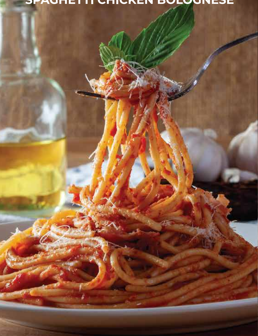
SPAGHETTI CHICKEN BOLOGNESE