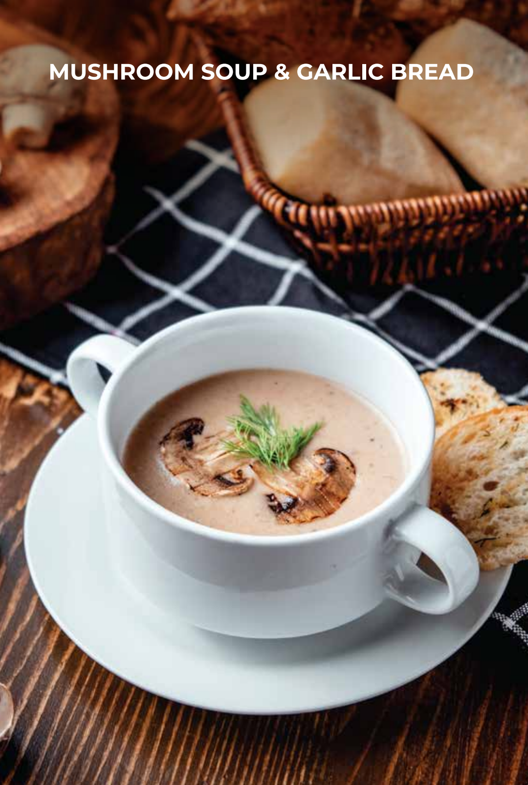
MUSHROOM SOUP & GARLIC BREAD