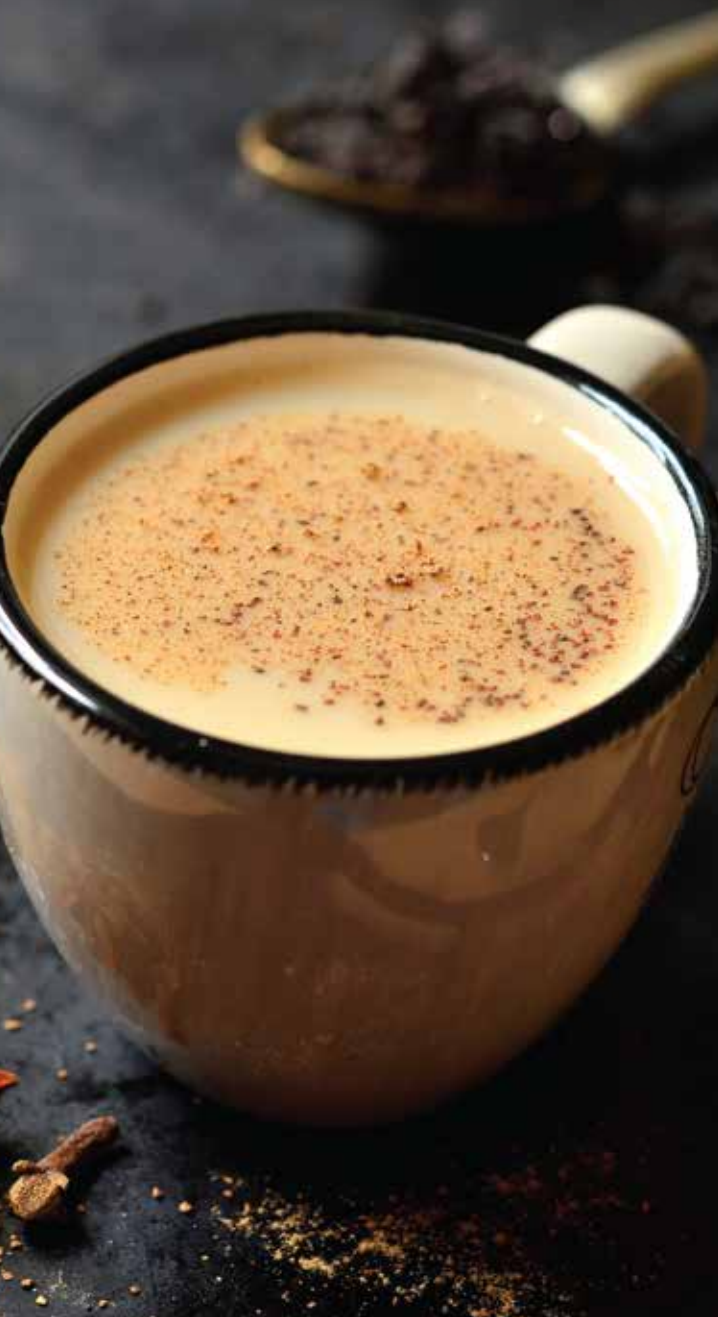
HOT MASALA TEA